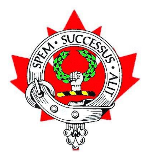
An Cirean Ceann Cinnidh